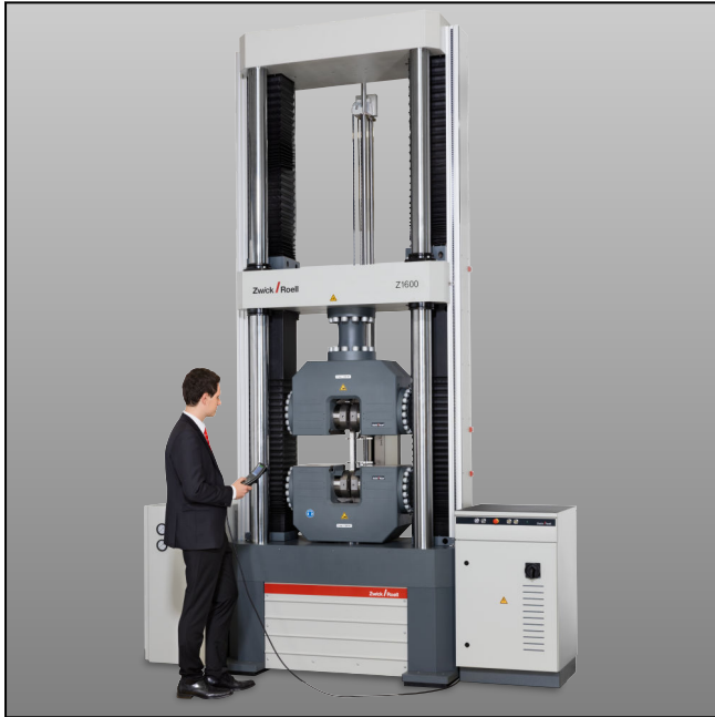
Z1600E with hydraulic grips